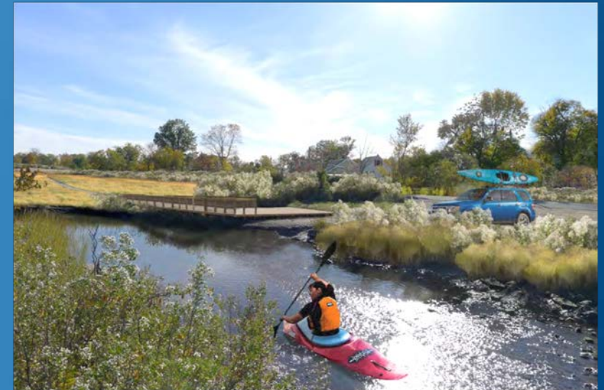
Woodbridge Township Report- Figure 5